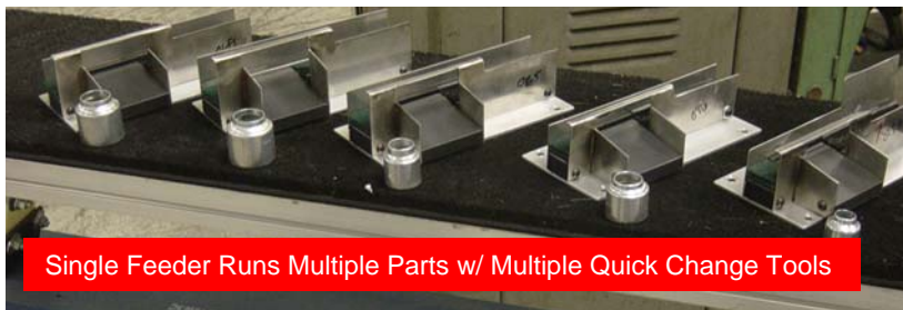
Single Feeder Runs Multiple Parts w/ Multiple Quick Change Tools