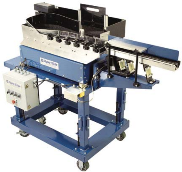
F1436 w/ Space Saver Hopper Discharge Rails, Portable Base