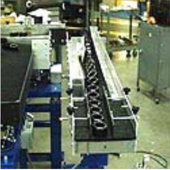
Ceramic Part - Twist Track to Horizontal Attitude