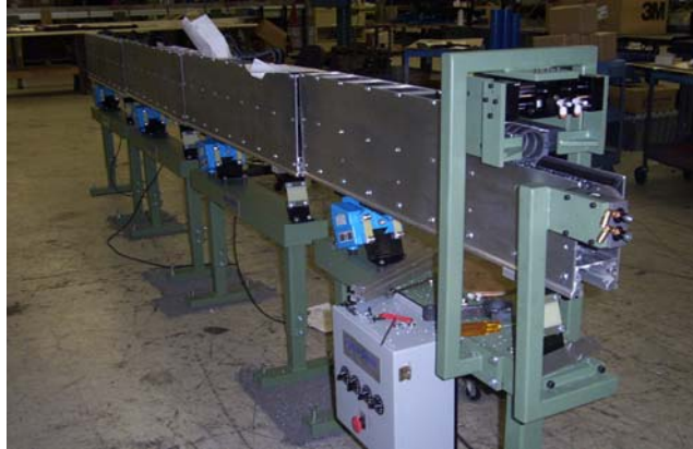
Finished Metal Part Twist – Head Hung Accumulation w/ Meter Escapement Device & Up-ENDER