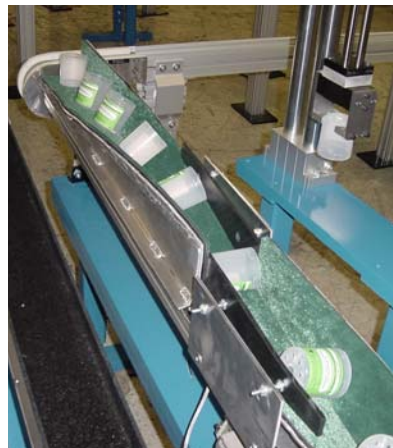
Plastic Jars – Twist Over to Packaging Cell

□CDS LIPE * 7650 Edgecomb Drive * Liverpool, N.Y. 13088 * 800-448-7822