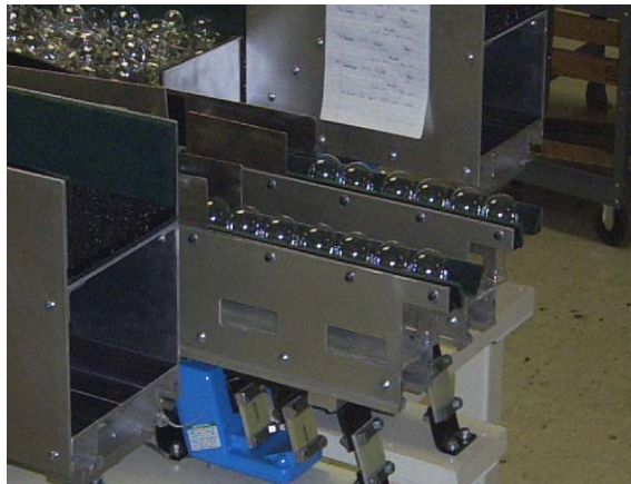
Light Bulbs – Orient & Head Hung Machining Packaging Cell