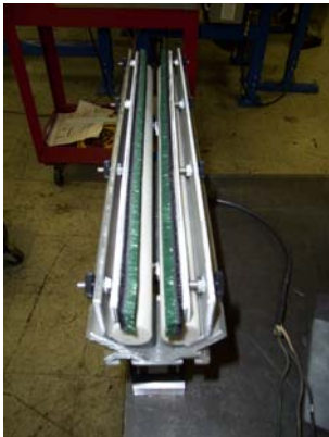
Brushed Rail – Buffer for Precision Assembly