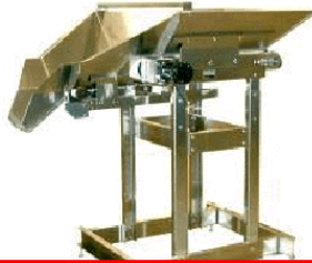
Sanitary-Bulk Supply Belt Hopper