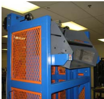
Programmable High Level Tote Dump