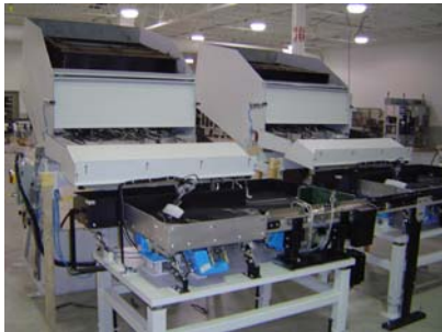
Multiple Products-Automated Dunnage Dumper Supplying parts to intermediate pan w/ flow gates. Parts supplied to Robotic Assembly Cell on demand