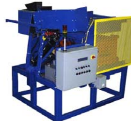
Corrugated Box Dump System

Container Dump System is designed to accommodate your container. System is fully integrated to any style of part feeder.