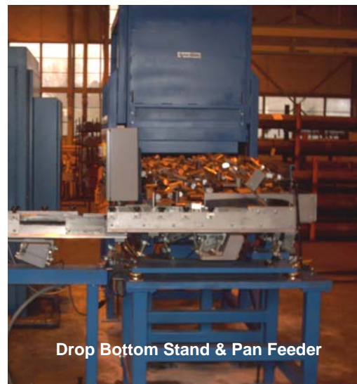
Drop Bottom Stand & Pan Feeder