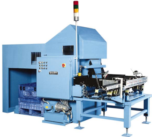
Soft Side Container Handling System

Container Dump System is designed to accommodate your container. System is fully integrated to any style of part feeder.